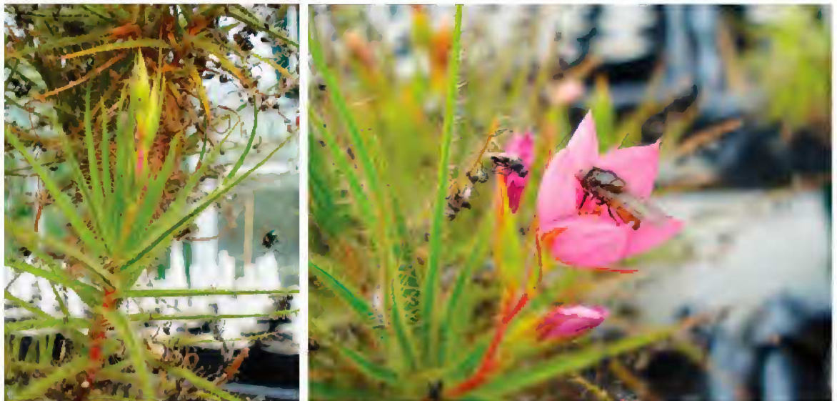
Figure 2: Roridula gorgonias growth point (left) and hover fly on the flower (right).

Four to five seeds are produced per capsule some 4 months later (Fig. 4). These are pale brown in color, cigar shaped, bear a distinct longitudinal ridge along one plane, and have an alveolate (honeycombed) surface. They are larger in size than R. gorgonias at about 4-5 mm in length and 1.5-2 mm in width. Dehiscence is achieved by the seed capsule splitting longitudinally along 3 planes, and the seeds fall to the ground as the fruit is pendulous (Fig. 5). Interestingly, very few seeds are to be found caught on the resinous leaves, suggesting that the seeds are either thrown clear of the mother plant (which is doubtful as seeds are usually found at the base), or they have a coating which in some way does not adhere to the leaves.